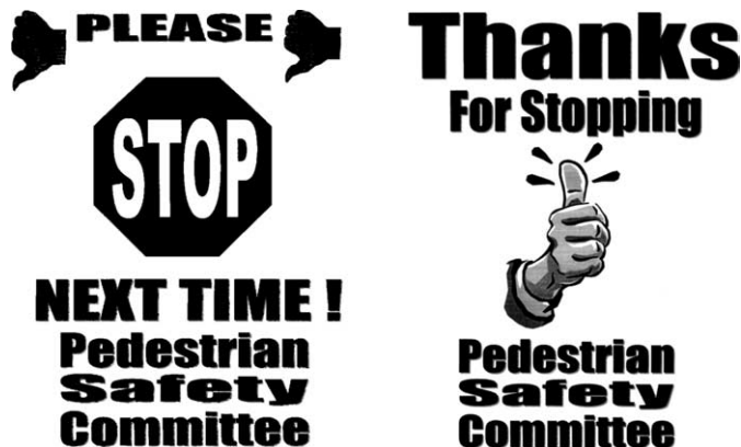
Fig. 2. Stimuli used for drivers.

The study used two sets of 8 1/2 in. × 12 in. signs with written and graphic content, shown in Fig. 2. One, on green paper, showed a large “thumbs up” sign and thanked drivers for stopping (consequence). The other, on pink paper, had two smaller “thumbs down” signs and asked drivers to please stop the next time (consequence and prompt).